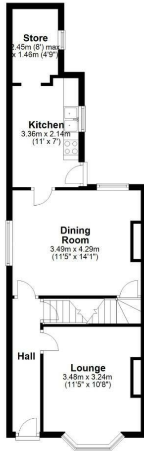
Ground Floor Approx. 45.7 sq. metres (492.2 sq. feet)